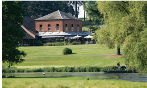
A five-star golf day experience...