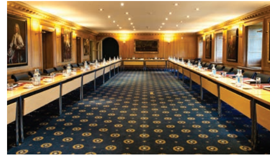
Brocket Hall offers the best of both worlds with fine golf and dining in an exquisite location...

The hall provides a wide array of gracious function rooms and can host private dinners and parties from 12 to 150 guests. For a grand occasion, the magnificent ballroom can accommodate 150 guests for a formal meal while, for a more intimate evening, the library, with its exquisite Chippendale bookcases, can comfortably host 20 guests and comes complete with panoramic views of the tranquil Broadwater Lake. The lime-oaked boardroom has been used by many of the world's most prominent organisations.